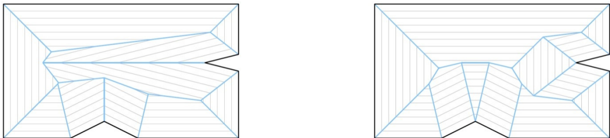
Fig. 1: (Left) The straight skeleton S(P) (blue) of an input polygon P (bold) is the union of the traces of offset-curve vertices. Several mitered offset curves are shown in gray. (Right) Beveled offset curves based on the linear axis, a variant of the straight skeleton.

The straight skeleton of a polygon in 2D was first defined by Aichholzer et al. [2]. It is the geometric graph whose edges are the traces of vertices of shrinking mitered offset curves of the polygon, see Figure 1, left. Straight skeletons are a versatile tool in computational geometry and have found applications in diverse fields of industry and science. E.g., Tomoeda et al. use straight skeletons to create signs with an illusion of depth [8], while Sugihara uses (weighted) straight skeletons in the design of pop-up cards [6]. Aichholzer et al. [2] apply straight skeletons for roof design and terrain generation.